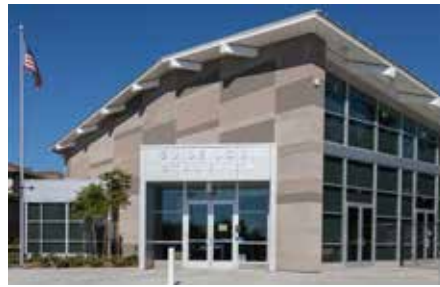
GDA's new state-of-the-art Visitor and Education Center.

This year, GDA celebrates 70 years of service to individuals who are blind or visually impaired. There have been many changes to the school since it opened in a private residence in North Hollywood, CA, including moving to the current 7.5-acre location in Sylmar, CA. What has not changed is GDA's commitment to its mission of "Independence, Companionship, Confidence, and Freedom."