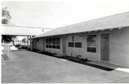
GDA's first location was a residence in North Hollywood.